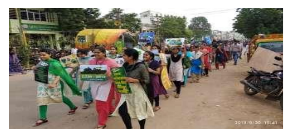
(volunteers, B. Tech students, Chalapthi Institute of Technology)